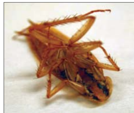
Figure 3. An adult roach cannibalized by young nymphs serves as a "walking bait arena."