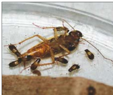
Figure 1. Nymphs feeding on excretions from the oral and anal regions of a dying cockroach.

CONCLUSIONS. Our study demonstrates a unique trophic cascade that leads to tertiary mortality. We describe a chain reaction in which a primary donor transfers