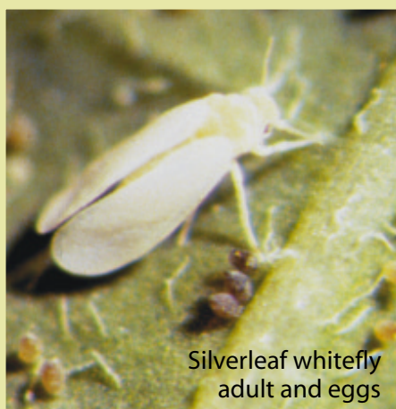
Silverleaf whitefly adult and eggs