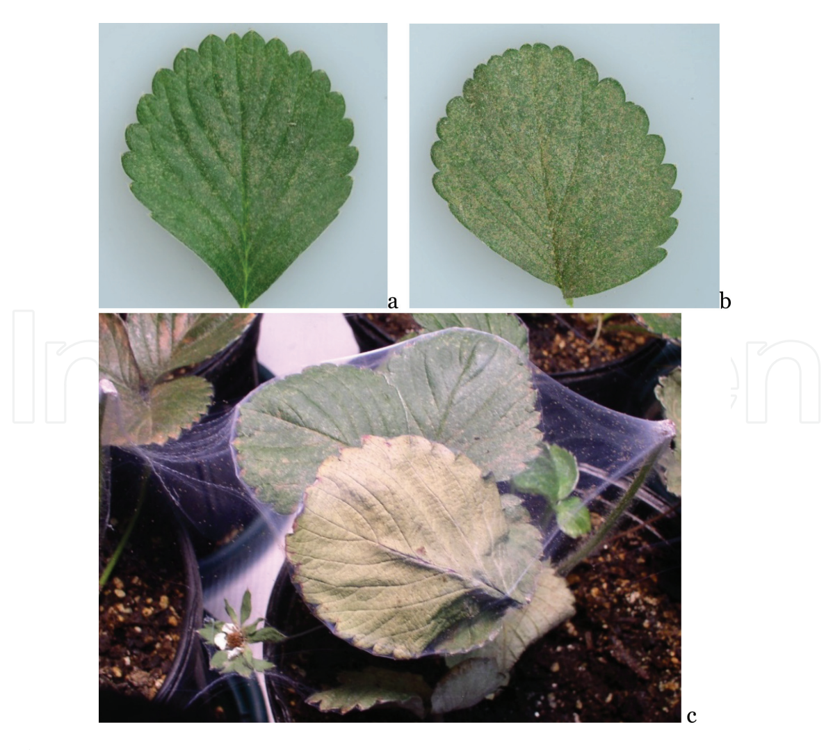
Figure 2. Examples of (a) and (b) stippling injury to strawberry leaves and (c) spider mite webbing.

Monitoring can be accomplished by checking and counting twospotted spider mites on the underside of strawberry leaves with a 10x hand lens [3]. Alternatively, strawberry leaves can be collected from the field and examined later. Leaf samples should be processed within 3 days of collection if possible. In annual production, sampling for twospotted spider mites should begin after the transplants have become established. In perennial culture, sampling should start once the new leaves fully open in the Spring. Sample 13–25 fully mature leaves per hectare. Counting the number of spider mites on each leaf will give more accurate results, but it can be time consuming. An alternative is simply to note how many leaves have spider mites present on them. A presence/absence system is used