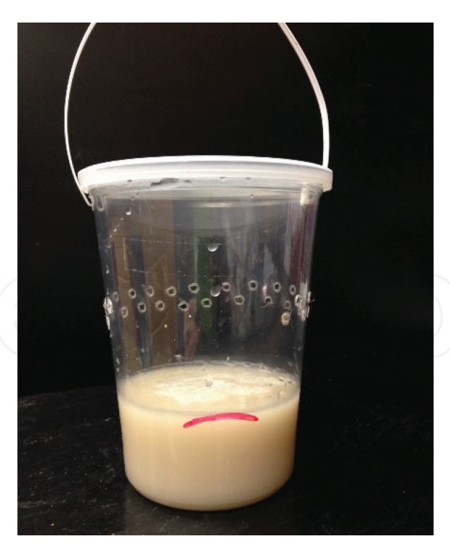
Figure 14. Home-made spotted wing drosophila trap baited with yeast, sugar, and water mix.

emptied into another container or dumped through a filter screen. As females often arrive earlier than males, examining the flies on the screen with a hand lens even if no flies with wing spots are present is very important. There is no threshold for spotted wing drosophila and most growers begin a spray program once flies are found in traps.