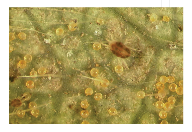
Figure 1. Twospotted spider mites and eggs on the underside of a strawberry leaf as seen under a microscope.

Twospotted spider mites, Tetranychus urticae Koch ( Figure 1 ) are oval shaped and tiny. The adults are 0.5 mm in length, which is about the size of a period in 12-point font. They are usually light greenish-yellow in color with two large, dark spots on their abdomens. However, brown, red, orange, and darker green forms also occur. The eggs are spherical and clear to tan in color. The eggs and all stages of mites are usually found on the undersides of leaves. The twospotted spider mite life cycle progresses through five stages: egg, six-legged larvae, protonymph, deutonymph, and adult. Each of the three intermediate stages feeds and grows for