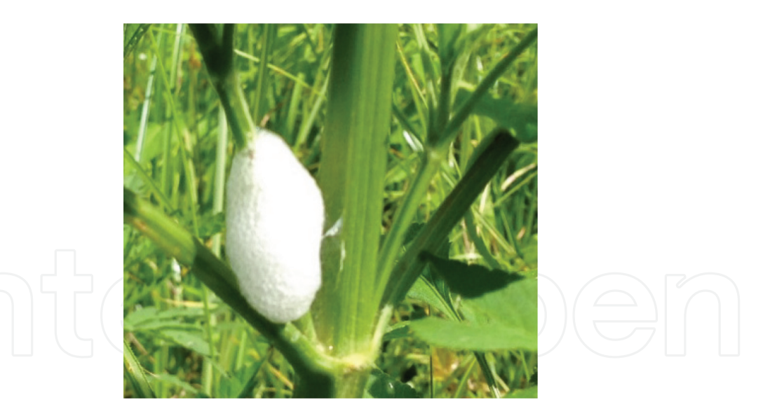
Figure 8. Spittlebug protective frothy foam. The spittle bug nymphs are underneath the foam and cannot be seen.

important to properly identify any stink bug causing concern in strawberries to make sure it is not a beneficial predatory species.