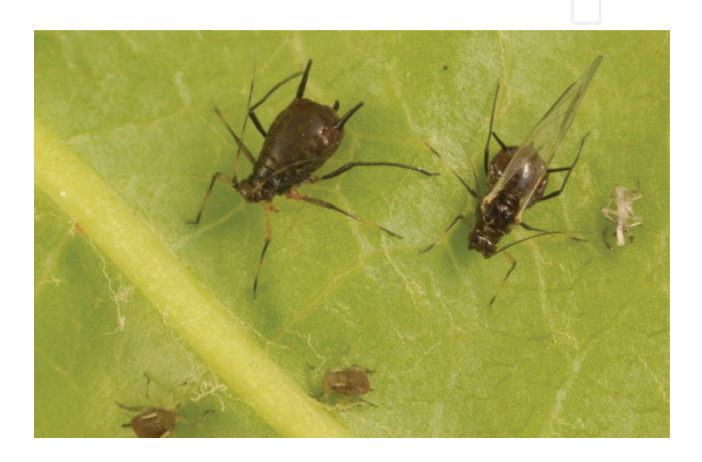
Figure 6. Aphids on a grape leaf.

Winged females enter fields from nearby infested crops or weedy areas [3, 7]. They can also enter greenhouses. Female aphids can produce daughters without mating, so populations can build up very quickly. Aphids use their sucking mouthparts to feed on plant juices and excrete excess sugar as a sticky, sugary honeydew. Sooty mold fungus will grow on the honeydew and can contaminate fruit. Aphids efficiently transmit plant viruses. In strawberry production, these viruses are mainly a concern in nursery production. Viruses can also persist from one season to another in perennial production, but this is a rare occurrence.