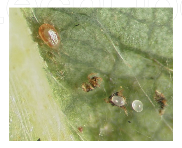
Figure 3. N. californicus mite and eggs on a strawberry leaf.

Cyclamen mites, Phytonemus pallidus (Banks), are half the size of spider mites, \sim 0.25 mm, and invisible to the naked eye [3, 7]. Adults are shiny and pinkish to orangish in color while immatures are opaque white. Eggs are ovoid and translucent. They feed on developing tissues and are most commonly found on unfolded