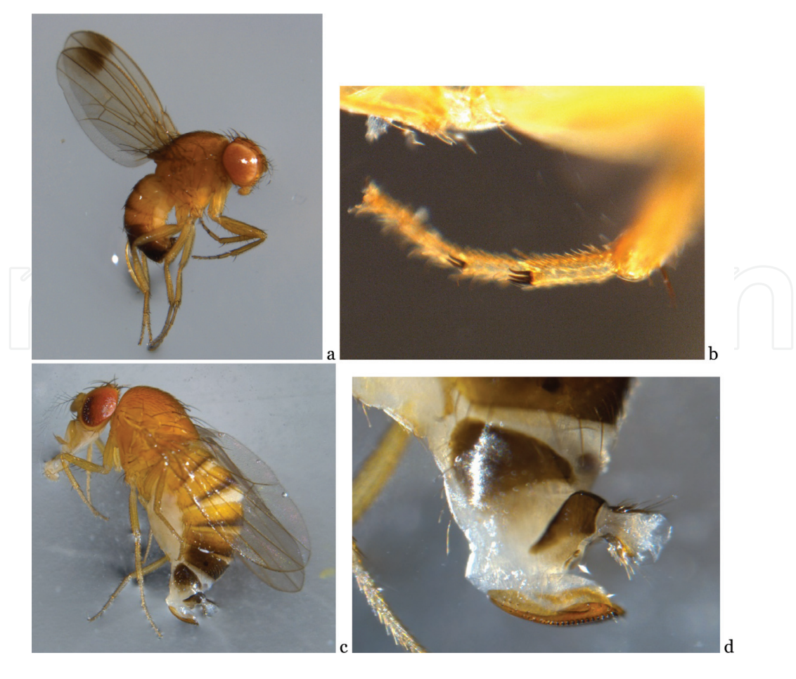
Figure 13. Spotted wing drosophila (a) male, (b) enlarged view of male foreleg showing the two combs, (c) female, and (d) enlarged picture of female ovipositor.

Adult spotted wing drosophila can be monitored with traps [24]. There are several commercially available traps and baits but a bait specific to spotted wing drosophila has not yet been developed. Soapy water is used as the drowning solution in these traps. Homemade traps can provide a more cost-effective option. Any plastic container with a lid that is around the size of a peanut butter jar can be used in trap construction. Punch two or three rows of holes around the middle of the plastic container leaving a 1" unpunched area so the trap contents can easily be poured out. The holes should be large enough to allow spotted wing drosophila to enter but not so large that bees and other pollinators can enter. String or a long twist tie can be used to create a hanger for the trap by tying it through holes on either side of the trap. An example of a home-made trap is shown in Figure 14 . The most effective homemade bait is a mixture of yeast, sugar, and water. Mix 2 tsp. sugar and ½ tsp. active dry yeast in 2/3 cup water per trap. In this case, the bait also serves as the drowning solution. Traps should be checked weekly. The contents can be