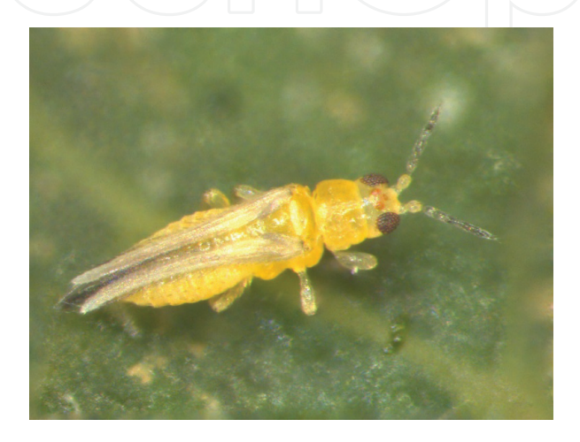
Figure 5. Chili thrips adult.

Adults and immatures feed on young strawberry leaves causing darkening of the leaf veins near the leaf base [12, 13]. As the infestation progresses, the darkening