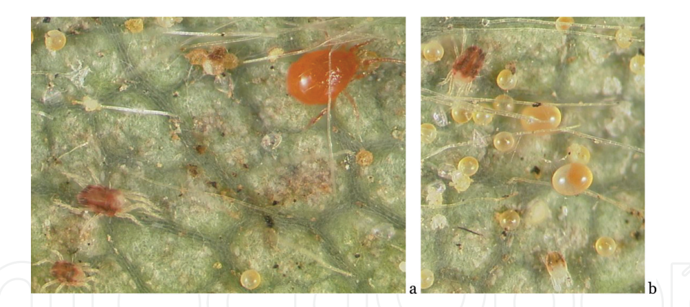
Figure 4. P. persimilis (a) adult and (b) eggs with twospotted spider mites and eggs on a strawberry leaf.

leaves near the midvein and in flower buds. Infested leaves are small and wrinkled. High infestations can cause a compact mass of these leaves in the center of plants. Injury to leaves causes them to turn brown, wither, and die. Any fruit produced is stunted and russety.