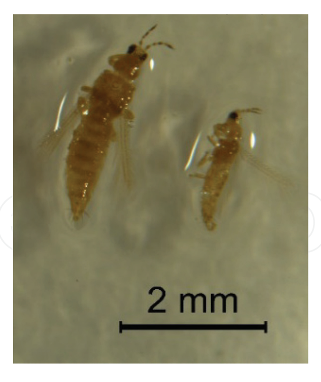
Figure 12. Western flower thrips female (left) and male (right) (photo credit: E.M. Rhodes, UF).

( Orius spp. and Geocoris spp.), that are common in the strawberry system, regulate thrips populations.