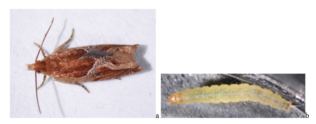
Figure 10. Strawberry leaf roller (a) adult and (b) caterpillar.

Salt marsh caterpillars ( Figure 11 ), Estigmene acrea (Drury), are the caterpillars of a species of tiger moth [17]. The adult moths are white with black spots with a pinkish to orangish abdomen that also has black spots. Female hind wings are white while male hind wings are yellowish to orangish in color. The caterpillars are