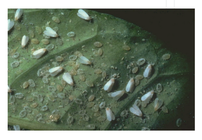
Figure 7. Whiteflies on a squash leaf.

Adult whiteflies can be monitored using yellow sticky traps [7]. One trap per 25 hectares should be hung from a stake just above the crop canopy and checked weekly. It is important to monitor nymphs at the same time. This is done by checking 20 mature leaves from each field quarter. There is no treatment threshold.