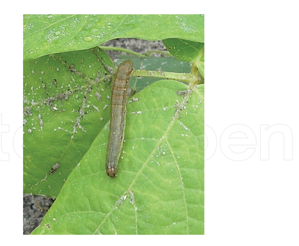
Figure 9. Later instar fall armyworm on velvet bean plant.

on these areas [3, 7]. As with armyworms, young plants are especially vulnerable. There are no established thresholds.