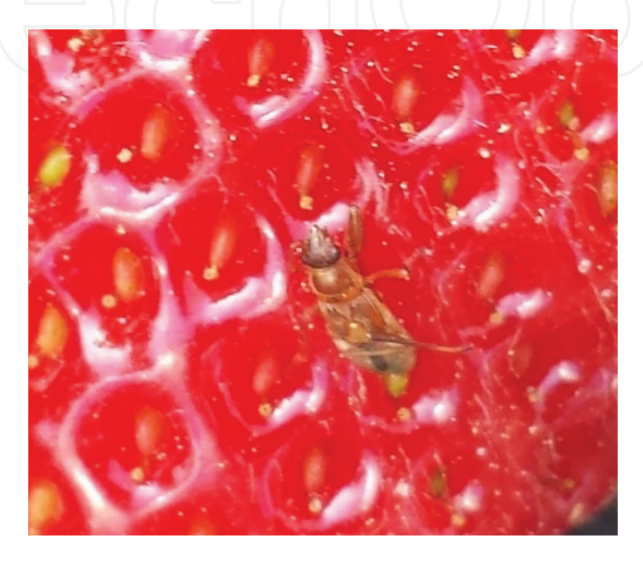
Figure 15. The strawberry seedbug.

The strawberry sap beetle, Stelidota geminate (Say), is one of many sap beetles, family Nitidulidae, that are found in strawberry plantings. Along with the strawberry sap beetle, the dusky sap beetle, Carpophilus lugubris Murray, and the fourspotted sap beetle, Glischrochilus quadrisignatus (Say), are the most common