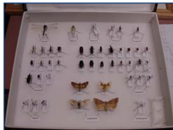
Insect collection box 1 of 2