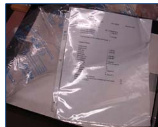
How to package collection